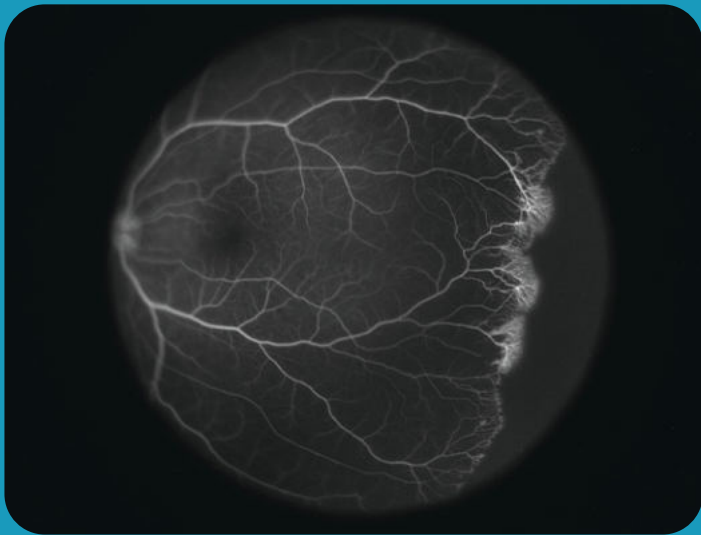
Peak Phase: Contrast of blood vessels attains its peak